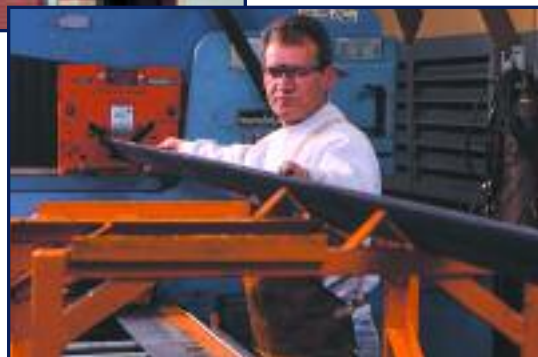
Right: An AM&G craftsman fabricates a steel angle iron in our 5,000 square foot metal shop.