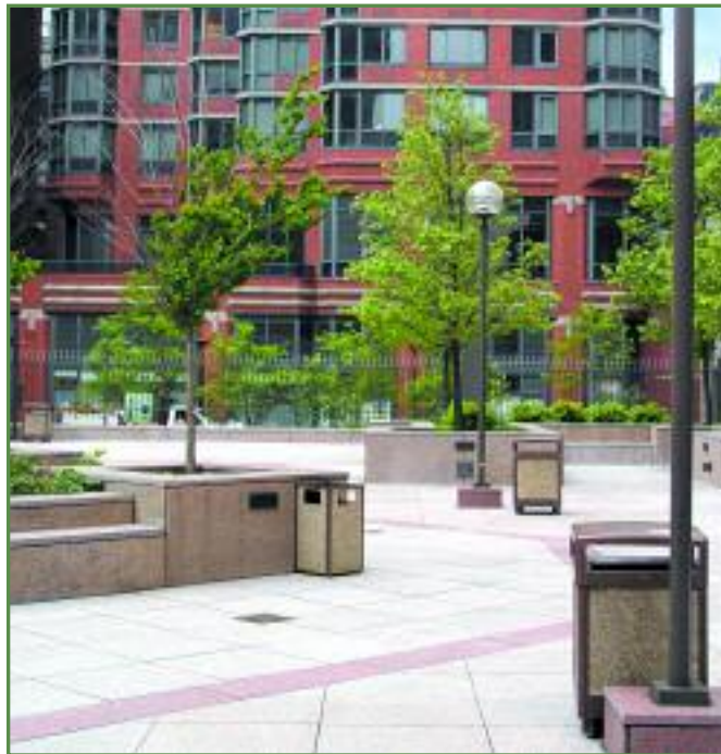
Left: AT&T Plaza, lower Manhattan Full restoration of plaza including lighting, fencing and gate fabrication.