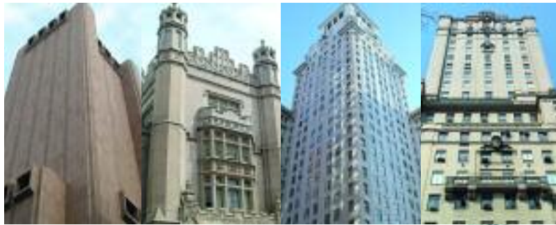
The Full Service Exterior Contractor

AM&G has earned the confidence of New York's most high profile builders and architects. We've proven ourselves as both premier exterior contractors, and experts in waterproofing and restoration. We invite you to review some of our projects on the following pages, and see why AM&G is one of New York's most trusted supplier of restoration services for landmark, multi-dwelling, office, educational buildings, and more.