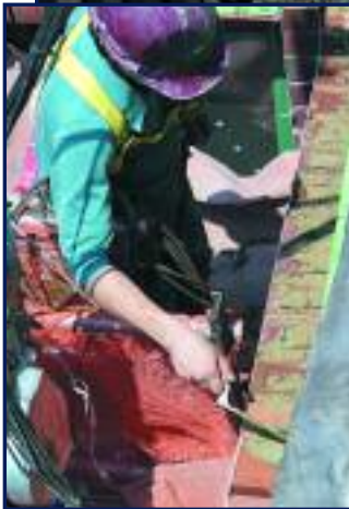
Top: Columbia Presbyterian Hospital Our extensive reconstruction included rebuilding of parapets, as well as steel beam and column repairs. Included was the rebuilding of the tower's brick corner, and extensive roofing and lintel repairs.