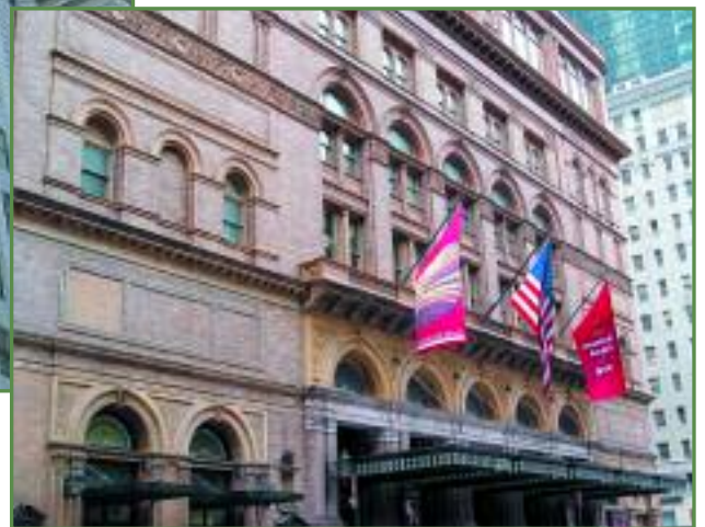
Below: Carnegie Hall

AM&G replaced approximately 800 pieces of terracotta, and completely restored and cleaned the 27-story facade. AM&G also replaced the building's roof.