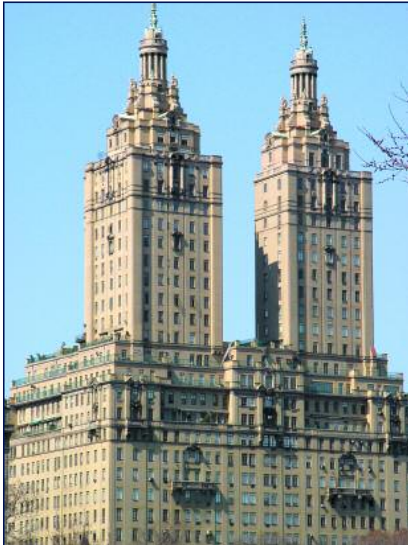
Above: The San Remo

This 10 year restoration project included replacement of terracotta ornaments, trim, and architectural detail, as well as exterior brickwork. The project also entailed replacement of all terrace roofs with bluestone.