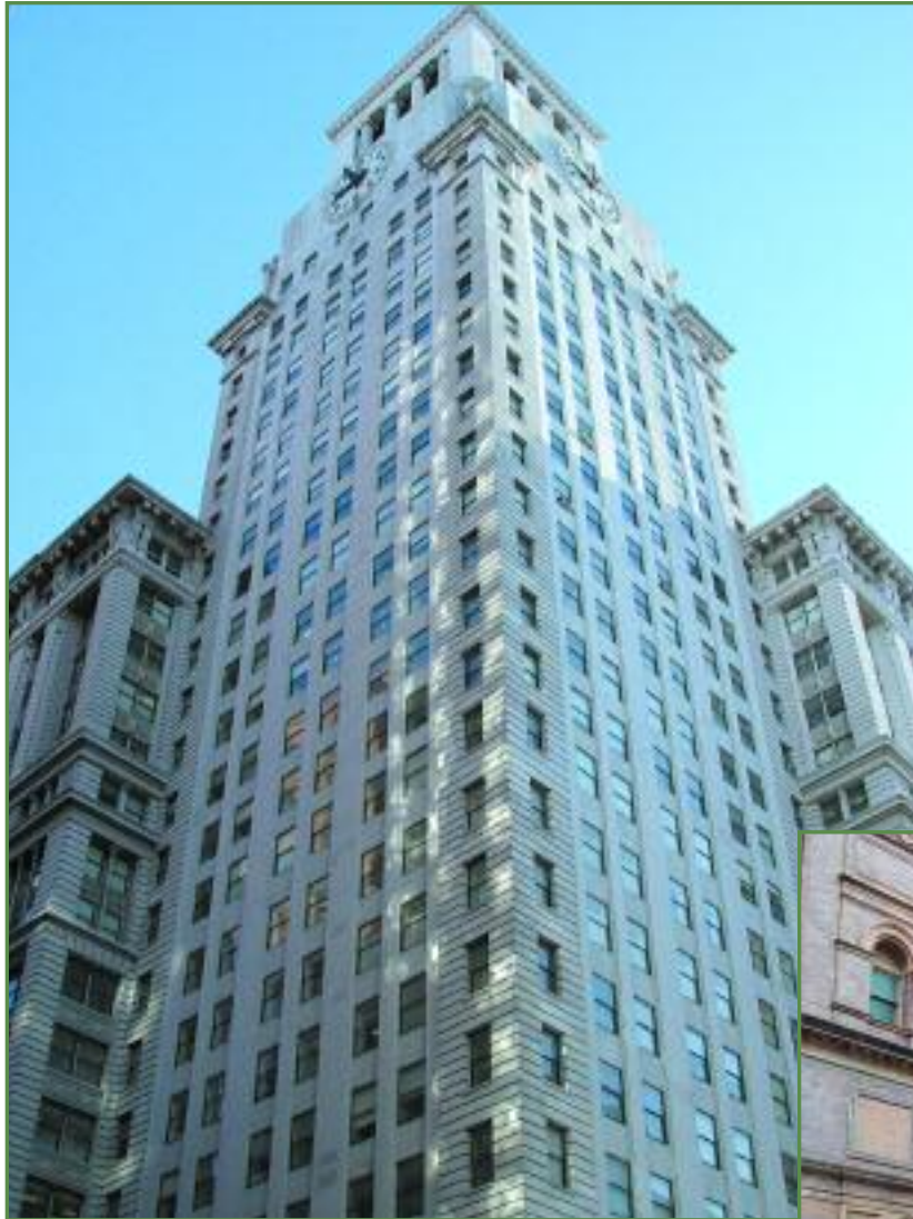
Above: Con Edison, Irving Place

Large, high-profile projects demand dependability and top performance at every level. Often, the scope of a restoration job means much of the work is behind-the-scenes—on rooftops or many floors above the ground. With AM&G you can rest assured every aspect of a project is being done properly. We bring a demanding high standard of workmanship and precision to each project. Our record speaks for itself: AM&G has never been called back to redo a project. In fact, we are frequently the contractor of choice to troubleshoot difficult jobs that have challenged other firms.