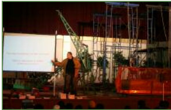
Left: Each project year begins with a mandatory three-day Job Safety Seminar for all crew members, and a CPR emergency training and certification program for all site foremen.