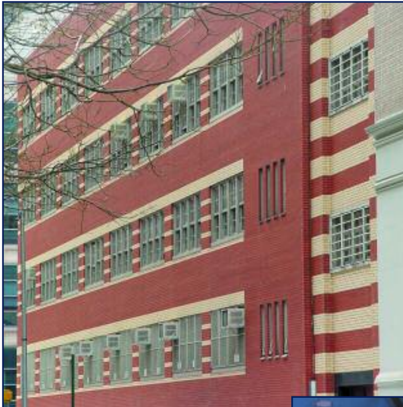
Above: Westinghouse High School, Downtown Brooklyn AM&G’s work included removal and reconstruction of the entire brick facade.

We also maintain a tradition of craftsmanship that lets us handle demanding renovation and restoration projects. Most of our craftsmen have been with our organization since the beginning. This assures consistency in our work and quality at the job site.