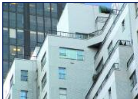
Above: 60 West 57th Street AM&G completely demolished and reconstructed parapets throughout the building, replacing corroding iron railings with aluminum railings.

AM&G brings a thorough knowledge of building materials, local building laws, and structural issues to every job. Our crew of workmen, including roofers, masons and carpenters, executes projects with the utmost skill, making sure disruption is kept to a minimum.